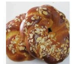
2 lb Round - $20.00 each Wrapped in freezer bag

Accepted payment include: Cash, Check, or Venmo payments accepted at: