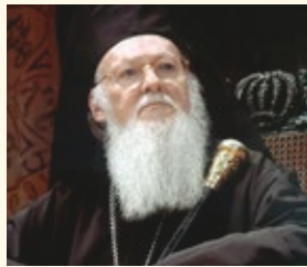
Ecumenical Patriarch Bartholomew