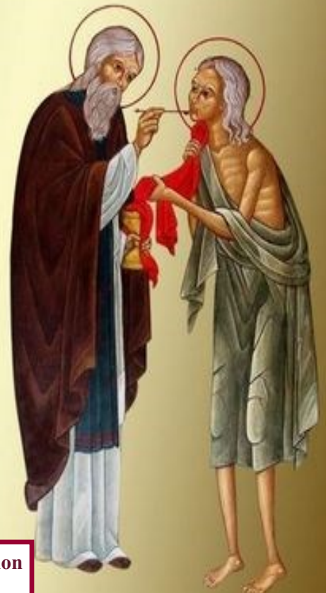
St. Mary of Egypt receiving Holy Communion from St. Zozimas